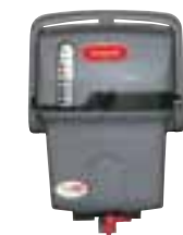
TrueSTEAM™ Humidification System

Only three wires from the thermostat to the Equipment Interface Module make even retrofit installations quick and easy.